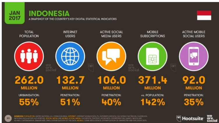
Figure 1.1 User Composition of Internet User in Indonesia

The development internet in the world also related to the gadget especially mobile phones. According to data, we can look that 93 percent of all internet users now go online via mobile devices (phones or tablets), and with the majority of new internet users now ‘phone first’, mobile’s share is likely to increase even more over the coming months (Hootsuite, 2017). If we look at the Kominfo (Kementerian Komunikasi dan Informatika) data, the internet users reached 143.26 million of 262 million total population in Indonesia (Kominfo, 2017). This statement give result that online business is a fresh market in this era. The opportunity of online business is one of the strong reason many product/services start run their business in this platform. Now, we can look many application launched, online shop in social media like Facebook, Instagram, and also they who join in big online shop company, instance Tokopedia and OLX.