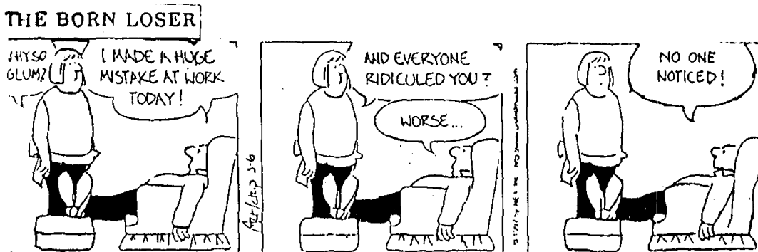
picture1. Huge Mistake

This comic strips represent a condition in a society who has no concern with others. This condition can easily be found in today's society. In such humorous way this comic strips brings about the problem of apathy which is widely-spread among most people in almost every society. The pun of the humor can be seen through the comic strips. The writer observes the pun of the humor from the expectation and reality in those comic strips. In a real world or society, when a person does a mistake, others will notice easily and surely will ridicule the person and the person will find a way so that no one can notice his mistake. What has happened in these comic strips, however, is the opposite. The man made a huge mistake which can be easily noticed by others, but no one noticed.