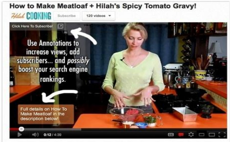
Figure 5.3 Example of Video Annotation

of subscribers or shares. Figure 5.3 is the example of video annotation.