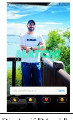
Display if "Match" with the person you like