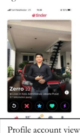
Figure 1: The Different view on Tinder

On the other hand, CMC allows individuals to communicate asynchronously because they can think about how to respond to display a positive self-presentation according to their goals. Asynchronous communication also allows users to create, edit, and display an idealized side of themselves, as asynchronous can provide time to think and choose what can be done to get what the individual wants (Attrill, 2015). This, for example, can be seen in the following image.