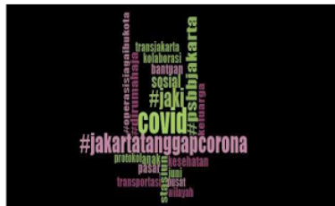
Figure 2 Word Cloud Account for West Java Governor