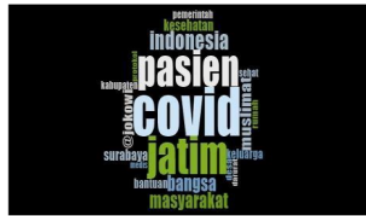
Figure 4 Word Cloud Account