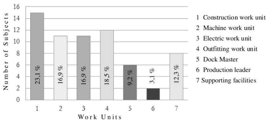
Figure 2. Research Subject Work Units Distribution at Shipyard Company, 2018

Description of daily risk factors for the subjects are shown in Table 1. As noted in Table 1, most subjects in this research smoke cigarette (53.1%), while only small proportion of subjects have hobbies related to noise such as listening to music using headset (14.1%). No subjects had any history of ototoxic drug use for the last 5 years. Only 1 subject (1.6%) had alcohol consumption habit.