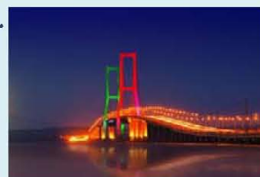
Suramadu Bridge .