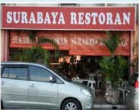
There are many restaurants in Surabaya.