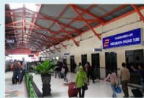
Pasar Turi Railway Station .