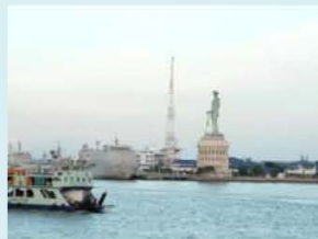
Tanjung Perak Harbor .