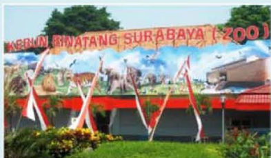
You can see animals at Surabaya Zoo .