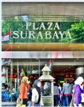
You can go shopping at Delta Plaza .