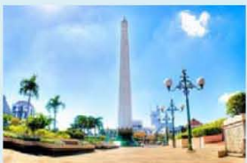
The monument is called Tugu Pahlawan.