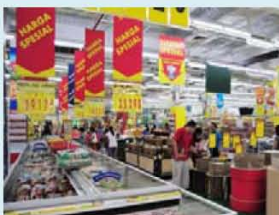
There are many supermarkets and shopping centers in Surabaya.