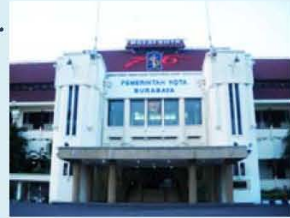
You can visit Surabaya Town Hall .