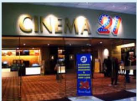
You can go to cinema to watch movie.