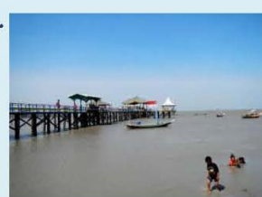
Kenjeran Beach .