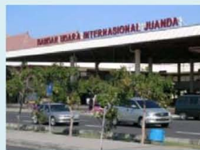
Juanda Airport .