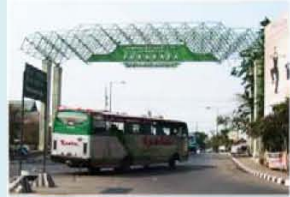
Bungurasih Terminal .