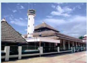
You can also visit Ampel Mosque .