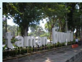
Bungkul Park is one of the public places in Surabaya.