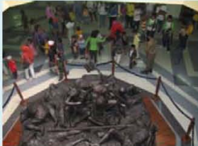
There is a museum in Tugu Pahlawan.