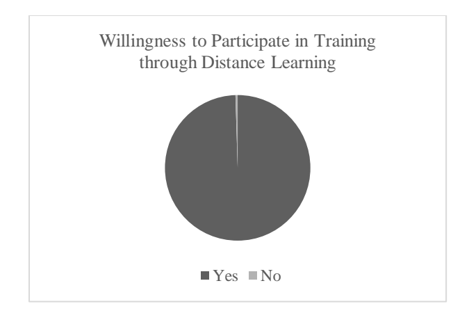
Figure 2. Willingness to Participate in Training through Distance Learning

This present study conducted in 2019 shows the results that can be seen in Figure 2, namely the interest of teachers to take part in training through distance learning is quite high. The results showed that 407 participants or 99.5% of the total participants were interested in participating in the training, while 2 participants or 0.5% of the total participants did not want to join the training. This data showed the desire of teachers to improve their competence through training was very high. This is an opportunity that can be used to help teachers in Indonesia to improve their competence in the field of teaching.