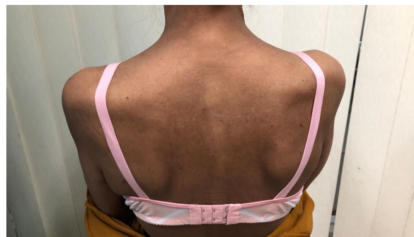
Figure 2. Atrophy of trapezius and other back muscles.