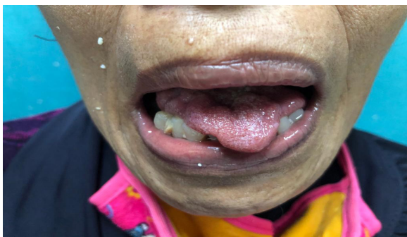
Figure 1. Lingual atrophy

and Rehabilitation clinic. The patient's Glasgow coma scale was 4x6, her verbal response was not assessable because the patient had hoarseness. Vital signs were within normal limits, no cyanosis and dyspnea were found on the patient. Her height and weight were 142 cm to 41 kg, with a body mass index (BMI) of 20.33 kg/m 2 . Head and neck inspection showed the patient was drooling, there was a decline in masseter muscle tone. The patient could not smile, close her mouth tightly, and purse her lips. Hypoglossal examination it was found that she was unable to protrude and move her tongue, lingual atrophy (Figure 1), and fasciculation was found. Through general inspection, atrophies were found on her masseter muscles, upper trapezius muscles (Figure 2), hypothenar, thenar (Figure 3), and almost in all other muscles of upper and lower extremities.