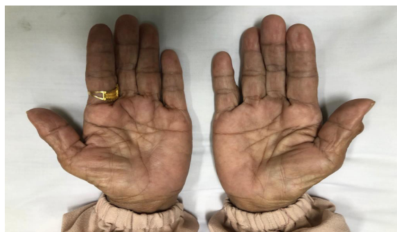
Figure 3. Atrophy of thenar and hypothenar muscle