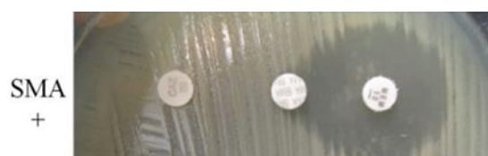
Fig. 2. Positive Sodium Mercaptoacetic Acid (SMA) test, marked by enlargement of meropenem zone of inhibition or bulging toward SMA disk.

Suspension of tested isolate with 0.5 McFarland turbidity standard was inoculated on Mueller Hinton Agar surface. SMA 3 mg disk (Eiken Chemical Co., Ltd.) were put between meropenem 10 \mu g disk (Oxoid) and ceftazidime 30 \mu g disk (Oxoid) disk with 10-15 mm range of each disk. Agar was then incubated 18-20 hours in 37°C. SMA tested positive if there were enlargement or bulging of one or both antibiotic inhibition zones toward SMA disk (Fig. 2).