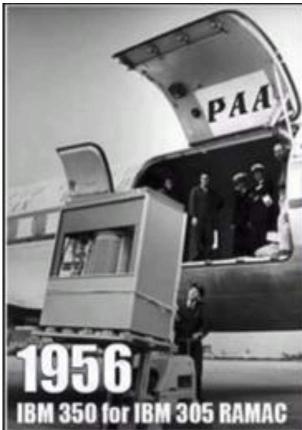
1956 IBM 350 for IBM 305 RAMAC