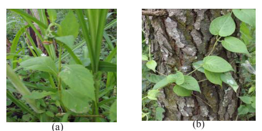
Figure 1 Photograph of Erechtites hieracifolia (a) and Paederia foetida (b) growing in Arjuno mountain forest