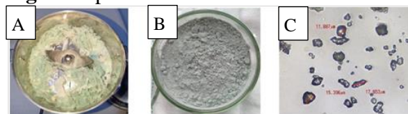
Fig. 1. Exposure material