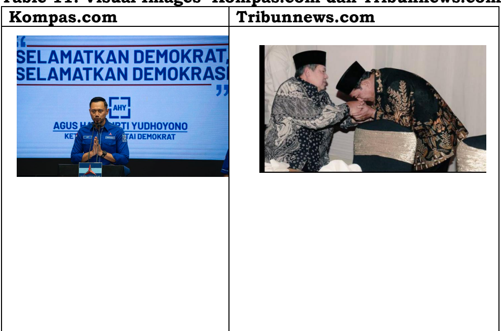
Table 11. Visual Images Kompas.com dan Tribunnews.com

Related to the protrusion of events (explication) as shown in Table 8, kompas.com and tribunnews.com seem to be inclined to package KLB as a party problem that leads to an internal power struggle. From the choice of words or sentences, kompas.com seems to direct readers' perceptions to internal problems, through highlighting the fact that there are party leaders who are persuaded by other party officials from different camps. Likewise, tribunnews.com presents the fact that there is a mass struggle within the internal body of the Democratic Party. This fact is further strengthened by the choice of the word "dualism" to direct readers to the context of internal problems that occur within the Democratic Party.