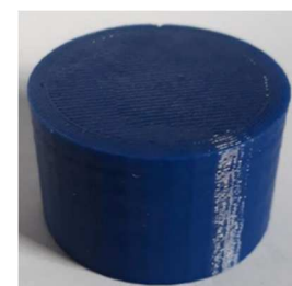
Fig. 4. PLA2