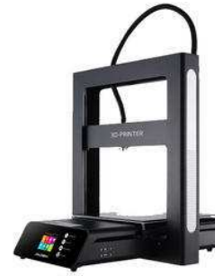
Fig. 2. 3D printer