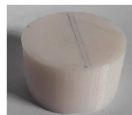
Fig. 3. PLA1