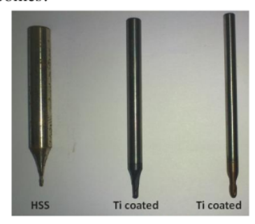
Fig.5 Some of cutting tools used in this study