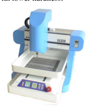
Fig.1 SIC-330 Mill CNC

Actually, there are two basic mechanical process technology that can be utilized for the purposes of this study, namely the process of milling and the turning processes. According to the higher process complexity, the mechanical milling process technology using a SIC-330 Mill CNC machine was chosen in this study. It has a 3 control axis, feed rate of 600mm/min with accuracy 0.001mm, spindle speed up to 24,000 RPM, and with the power of a motor of 1500W (Fig. 1). The process of milling was the machining/ forming process utilizing material hardness of cutting tools, linear motion and rotational motion to form materials with lower hardness.