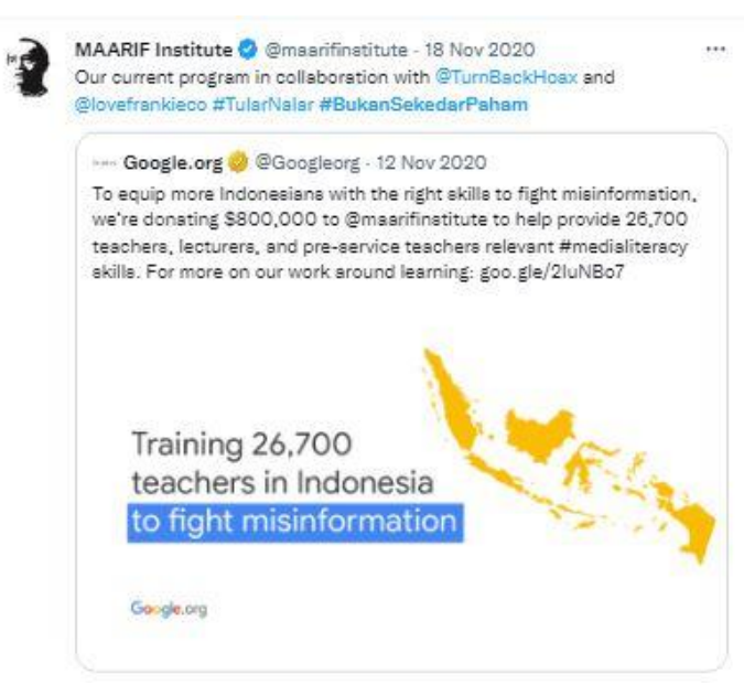
Figure 1. Tweet MAARIF Institute (@maarifinstitute, Nov 18, 2020)

measure the success rate of increasing the capacity of students' fact-checking ability at the affect, behavior, and cognitive levels.