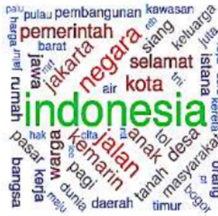
Chart 2. Buzzwords @Jokowi's Tweet during the election campaign

Based on the dominant buzzers' words used by @Jokowi, it appears that "Indonesian" discourse was adopted as the main discourse in articulating its rhetoric of populism. During the election campaign period from September 20 th ,2018 to October 21 st ,2019, @jokowi repeated a massive tweet with the most dominant keyword 'Indonesia'. Chart 2. shows the complete buzzwords analysis with the bigger size of the letters is directly proportional to how often the word is used in tweets. According to Laclau (in Jørgensen dan Phillips, 2002: 49-50), the word "Indonesia is what is called the nodal point that binds the whole hegemony of its populism discourse.