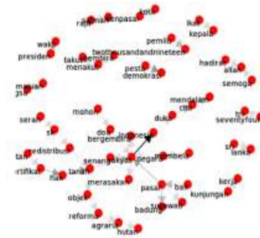
Chart 5. Semantic Analysis of @Prabowo’s Tweets during Election Campaign

Word "people" has become very central in articulating several issues. The word "rakyat/people" in the @prabowo populist rhetoric is articulated in a few sentences: "mohon doa rakyat Indonesia/beg for the prayers of the people of Indonesia", "rakyat gembira/the people are happy", "membela negara rakyat senang/defend the country the people are happy", "serah sk redistribusi tanah rakyat senang /hand over the redistribution of the land the people are happy", "rakyat indonesia duka cita mendalam /the Indonesian people are deeply mourning", and "sertifikat hak tanah rakyat/ certificates of people's land rights".