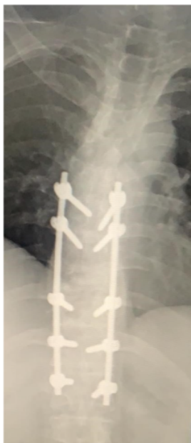
DOI: 10.12998/wjcc.v10.i21.7451 Copyright ©The Author(s) 2022.

Figure 1 Computed tomography imaging. A: Chest radiograph of the patient. The lungs were clear, with no masses, granulomas, nodules, consolidation, or collapse visible; B: Magnetic resonance imaging (MRI) of the spine showed a kyphotic thoracic curve, vertebral body destruction at C6, bulging abscess at T9-10, paravertebral abscess formation at L3-4, and abscess extension to the anterior spinal canal.