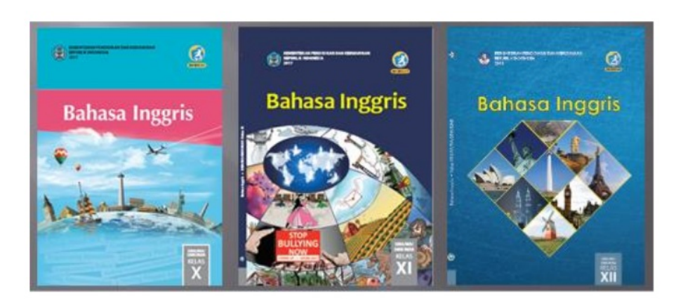
Figure 1. Online English Textbooks Provided by the Indonesian Government

Finally, religions of the figures were identified only when there was a clear indication of religious affiliation of the persons. Typically, female figures wearing hijab were identified as Muslim while other female figures were not marked as they did not appear to affiliate to a certain religion.