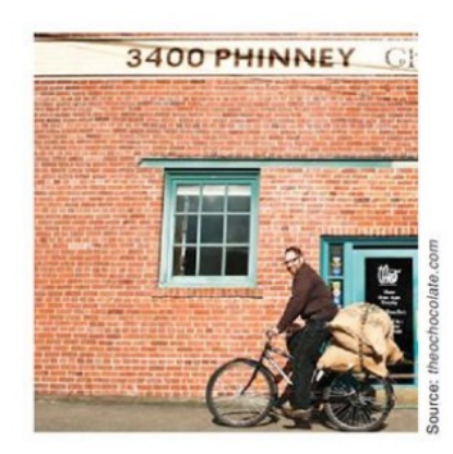
Figure 4. Sample Illustrations Representing International Culture

The illustrations in the three textbooks show that international culture is somewhat limited in terms of representations as the dominant one is the home culture. When it appears, the dominant international culture is the Western culture. Therefore, the international imagined community as reflected in the illustrations is marked by White Caucasian. The covers of the textbooks, for example, highlight the international nature of English education by providing the iconic Western culture in the images: the Liberty statue in the US, Sydney Opera House in Australia, and the Windmill in the Netherlands. These illustrations suggest that English is the language of dominant culture internationally. This is the target culture when Indonesian students learn English and the illustrations in the textbooks are better representing this attitude of many Indonesian, probably including the book writers and publishers. As shown in the examples on Figure 4, the target culture is represented in the image depicting a farmer markets with Whites are mostly on the picture and a biker in front of a chocolate factory in the US.