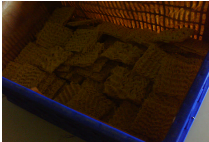
Gambar 4 Mie di dalam bak penampung