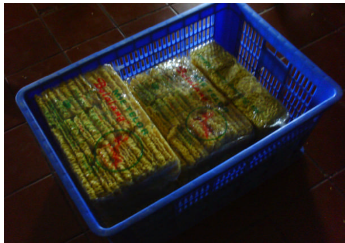
Gambar 7 Mie jadi di dalam bak penampung