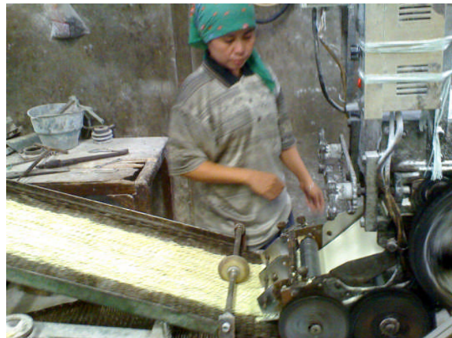
Gambar 2 Mesin Pemotong