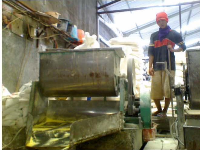
Gambar 1 Mesin mixer