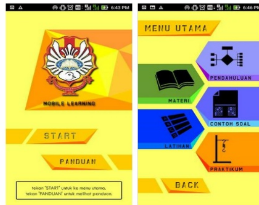
Figure 1. Layout of Beginning Part and the Main Menus in the Mobile App

The learning purpose is given in the introduction. The scope of the material which is covered in the mobile app is also shown in the concept map (see Figure 2).