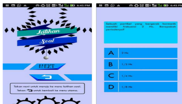
Figure 4. Exercise in the Mobile App

This study is still a preliminary study which needs more comprehensive investigation on the mobile app impacts in the physics learning process. In this study, we just investigated the impact of the use of mobile app on the cognitive aspects, whereas physics definitely not only includes cognitive aspects. Future study on this mobile app use in the physics learning is still required.