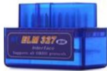
Figure 4: OBD-II dongle with the ELM327 integrated circuit and Bluetooth connection

OBD-II dongle with Bluetooth module is available very widely in the market. The system described here uses a simple OBD-II dongle with the ELM327 interface. Figure 4 shows the OBD-II dongle with the ELM327 integrated circuit and Bluetooth connection. This interface will allow the OBD-II protocol – which is CANBUS protocol – communicate with other peripherals using serial interconnection with simple ‘AT’ command. With the simple ‘AT’ command, the parameters can be extracted from the vehicle.