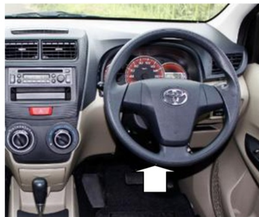
Figure 1: Illustration of the location of OBD-II connector indicated by arrow

can only fit with the male type B and not vice versa [2].